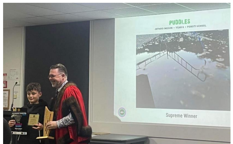
Trophy presentation by Whangarei Mayor Vince Cocurullo.