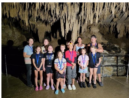
Te Aka Camp at Waipu